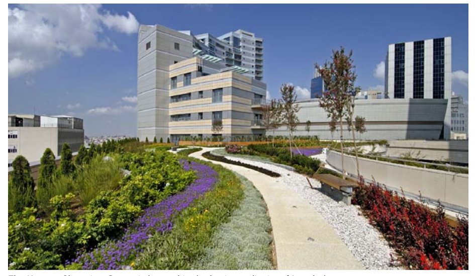
The Kanyon Shopping Centre is located in the business district of Istanbul.