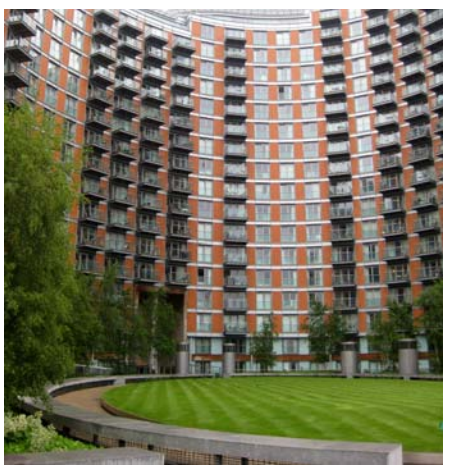
The inner courtyard with park benches above the underground garage