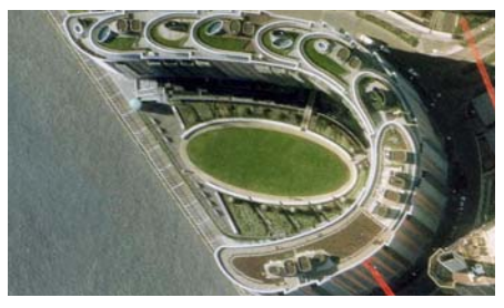
Aerial view of New Providence Wharf building in Iondon