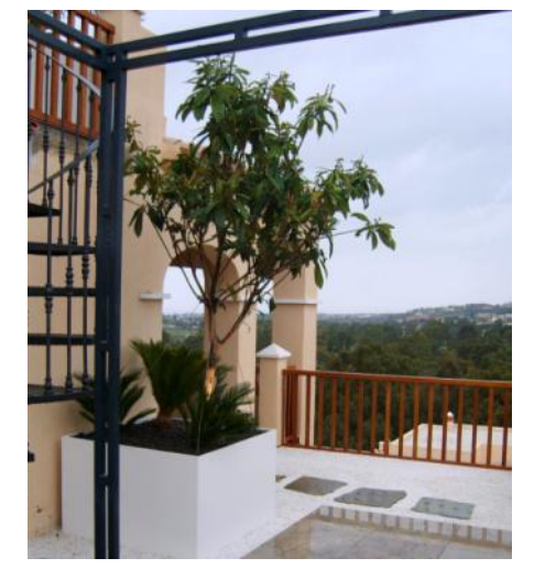
The different materials for the large terrace consisting of timber floor boards, granite and quartzite slabs combined with the planting areas make this roof garden to an exceptional Mediterranean lounge.