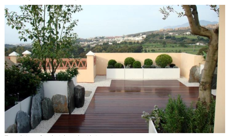
The exclusive roof garden is located amidst impressive scenery.