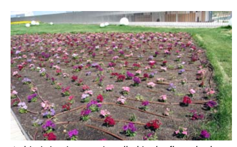
A drip irrigation was installed in the flowerbeds.