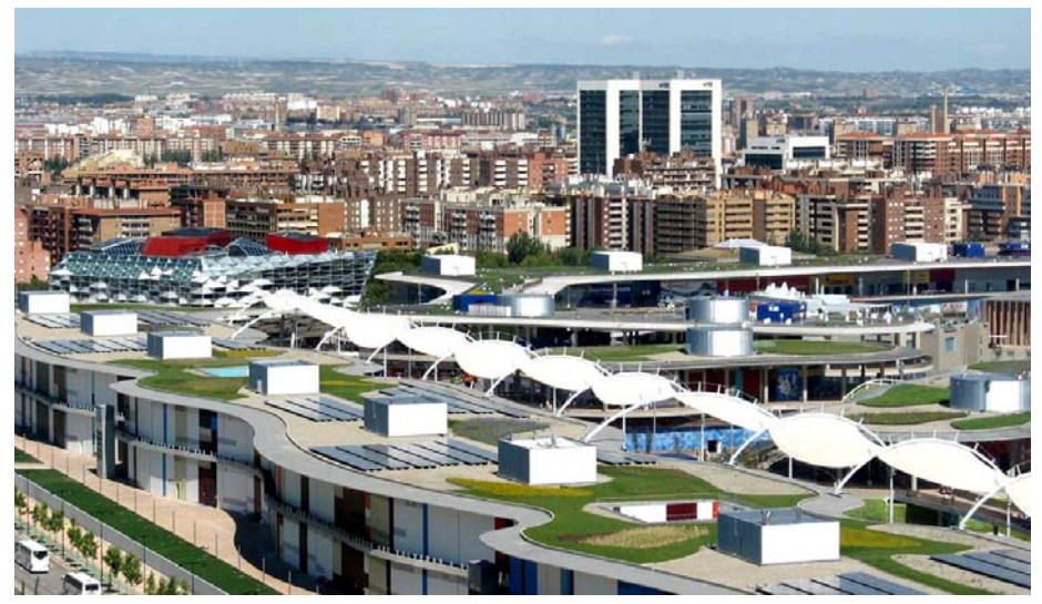
More than 70.000~\text{m}^2 of roof area were supplied with lawn, flowerbeds, party areas and walkways for the visitors of the Expo.