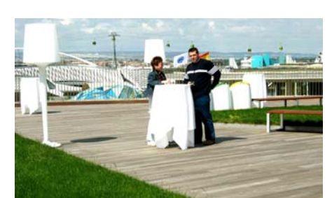
Lighting and tables complete the appearance of the roof landscape.