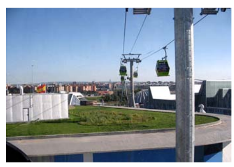
The complete area could be seen from the cable

Filter Sheet SF Floradrain® FD 40-E Protection Mat SSM 45 Roof construction with root resistant waterproofing