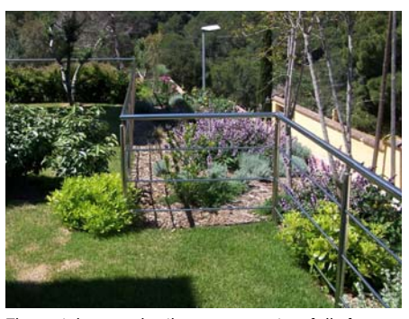
The stainless steel rail protects against falls from the accessible garage roof area.