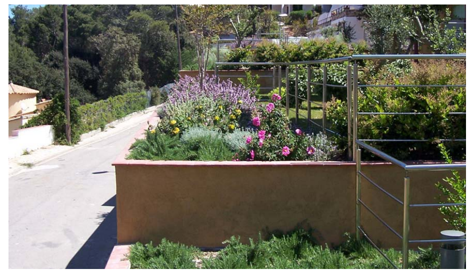
The garages with green roofs with a stainless steel rail in Sa Tuna-Begur.