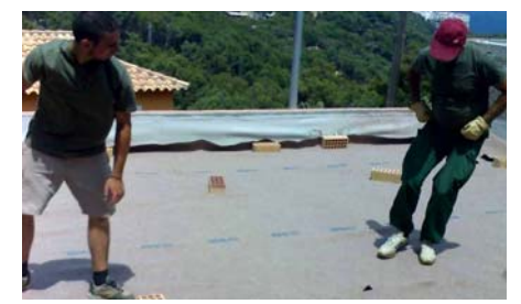
The already installed Protection Mat SSM 45.