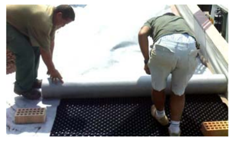
The Filter Sheet SF was placed on the drainage element Floradrain<sup>®</sup> FD 40-E.